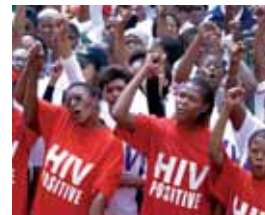
Front cover: Benny Gool/AP

41 reviews Art • Websites • Media • Viewpoint • eyespy